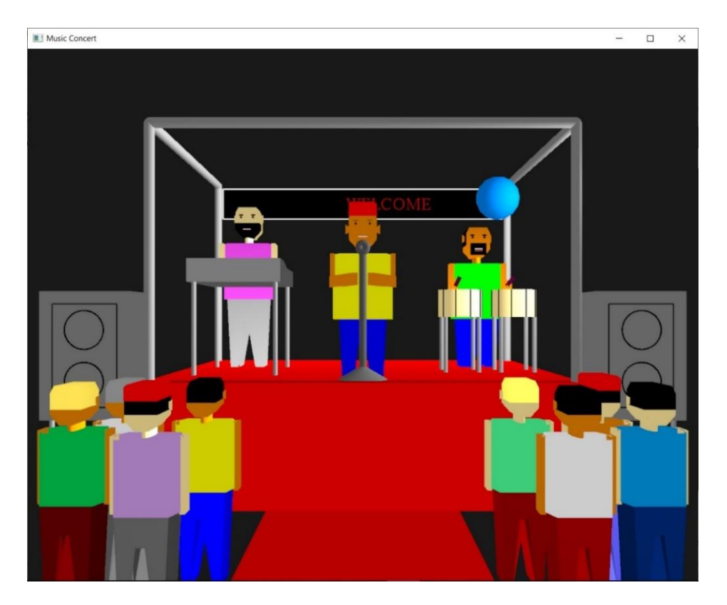
FIG 5.5 SNAPSHOT WITH MALE SINGER IN FRONT VIEW. SPOTLIGHTS ARE OFF.