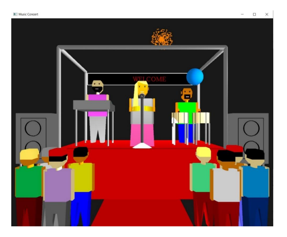
FIG 5.1 SNAPSHOT WITH FEMALE SINGER IN FRONT VIEW ALONG WITH FIREWORKS IN THE BACKGROUND. SPOTLIGHTS ARE ON.