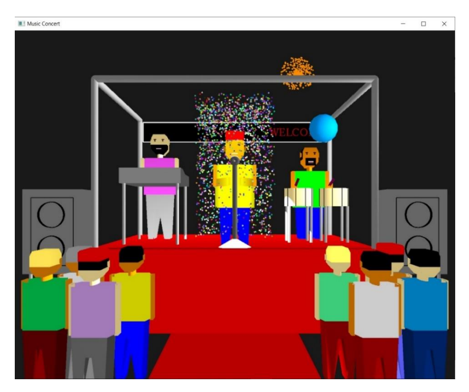
FIG 5.2 SNAPSHOT WITH MALE SINGER WITH CONFETTI SHOWER IN FRONT VIEW ALONG WITH FIREWORKS IN THE BACKGROUND. SPOTLIGHTS ARE ON.